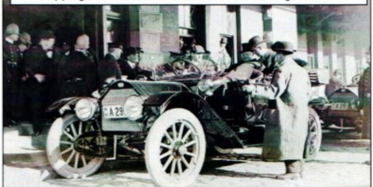
Wrapping the President in blankets for the long cool ride.

Under Taft the motor car went from the toy of the rich to cultural acceptance and on to the desire of everyone to be mobile beyond the train tracks. 1909 through 1913 was Taft's term of office as well as the years in which the Cole became established as a contender in the American Motor Car industry.